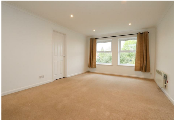
Ground Floor Entrance